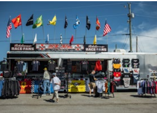
Fans can shop, dine and drink in the Fan Zone, as well as check out the many interactive manufacturer and other displays.